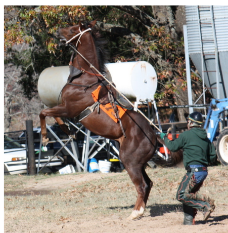
Saracen is kicking and screaming for a race

Finding a non-winner of three race at Charles Town has proven to be tough. At this point we are looking for the next opportunity that presents itself. The 4.5 furlong sprint distance at Charles Town should be right in his cross-hairs and we are optimistic for a return to the winners' circle.