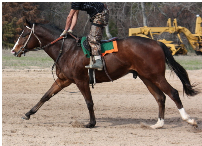
Training at Twin Oaks - February

This horse could double what we have invested in him by July. You could take a picture of Valentine Eddie to define the ideal body design of a powerful, compact sprinting two-year-old. This horse has grown immensely since his purchase last August. He is thick through the chest, strong in the rear, ripped with muscle and extremely efficient with his movements. He is nominated to the $75,000 Texas Thoroughbred Association Futurity Stakes and the $100,000 Texas Stallion Stakes.