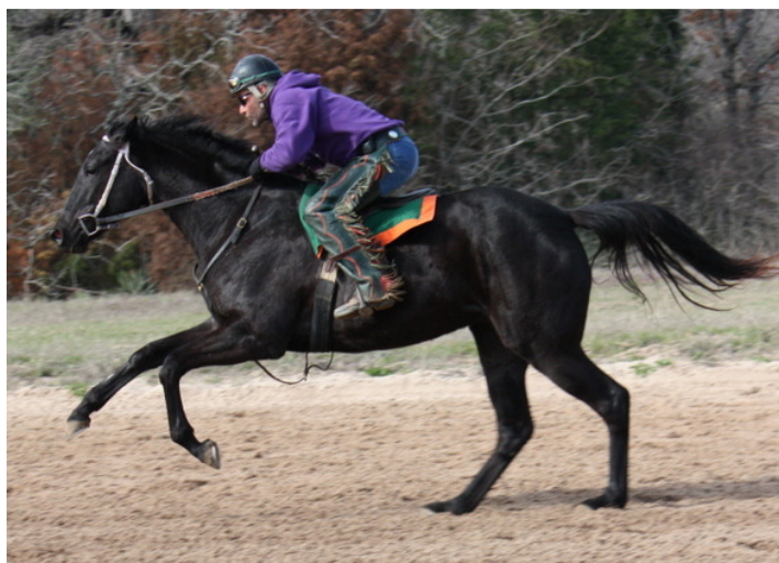
Breezing - February at Twin Oaks

Since the day we bought her this filly has never taken a step backwards. Sired by the multiple Graded Stakes winning sprinter, Mr. Greeley, and out of a very well-bred Fusaichi Pegasus mare, Sassy Kiss looks to have inherited all the talent we had hoped she would possess. overly precocious offspring, but our filly is moving forward exceptionally well. Her training has consistently resulted in top performances and her gate training has been flawless. She is showing some precocious talent, but looks to be too classy