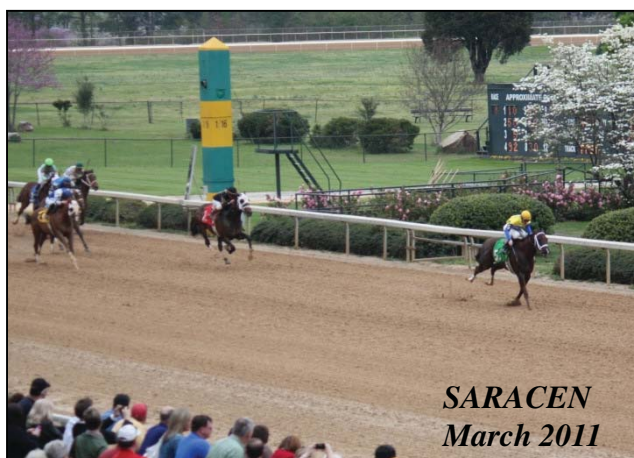
SARACEN March 2011