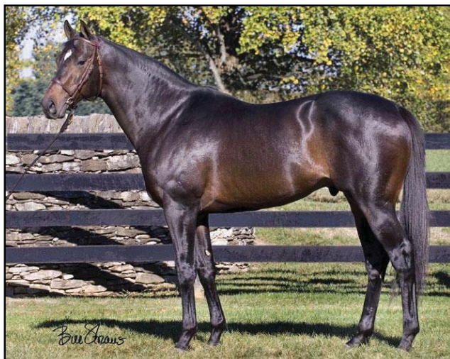
Oriente – Eclipse Champion Sprinter

Nationally ranked leading sire with progeny earnings of > $5 Million, three years in a row. ORIENTATE was a record-setting Graded Stakes Winner of $1,716,950, including the Breeders' Cup Sprint (G1). Stakes winner on dirt and turf, from 6 furlongs to 1 1/16 miles. Sire of 3 G1 winners: three-time G1 winner INTANGAROO - Humana Distaff H. (G1), LADY JOANNE - Alabama S. (G1), and LADY SPRINTER - Gran Premio Maipu (ARG G1). The first dam, LOVING LUCY, was a stakes winning, two-year-old miler. The second dam, ASSIUTA, recorded eight wins and was stakes placed as a two-year-old.