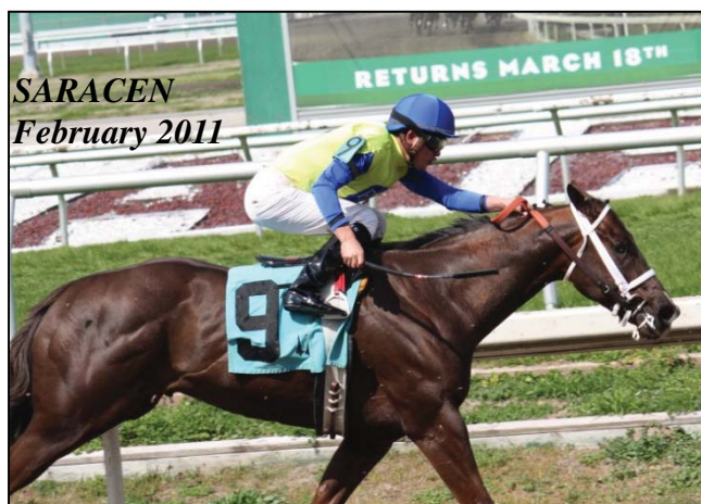
SARACEN February 2011

Nationally ranked leading sire with progeny earnings of > $5 Million, three years in a row. ORIENTATE was a record-setting Graded Stakes Winner of $1,716,950, including the Breeders' Cup Sprint (G1). Stakes winner on dirt and turf, from 6 furlongs to 1 1/16 miles. Sire of 3 G1 winners: three-time G1 winner INTANGAROO - Humana Distaff H. (G1), LADY JOANNE - Alabama S. (G1), and LADY SPRINTER - Gran Premio Maipu (ARG G1). The first dam, LOVING LUCY, was a stakes winning, two-year-old miler. The second dam, ASSIUTA, recorded eight wins and was stakes placed as a two-year-old.