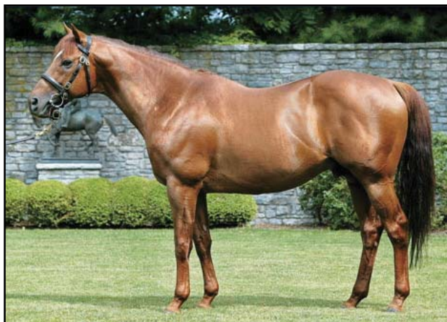
Thunder Gulch – Champion Sire

THUNDER GULCH is best known for his Eclipse Award winning three-year-old season when he won the Grade 1 Kentucky Derby, Belmont Stakes, Travers Stakes, and Florida Derby. He is a Champion Sire of 73 Stakes Winners, 38 of those Graded including POINT GIVEN, BALANCE, CIRCULAR QUAY, SPAIN and more $1,000,000+ winning horses. THUNDER GULCH also ranks in the top 5 of active U.S. Broodmare Sires. The first dam, PAINTBALL, has produced two runners, both winners. She was a durable runner recording wins at age 2, 3, and 4 and total earnings of $67,700. The dosage would indicate our horse will be most effective racing extended sprints.