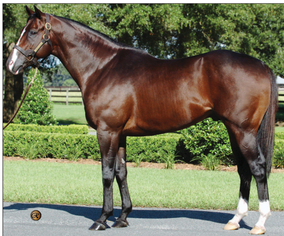
Rockin Z Ranch's Omega Code, a blistering fast juvenile and sophomore stakes winner, upends Tactical Cat to lead all sires in Oklahoma in 2011