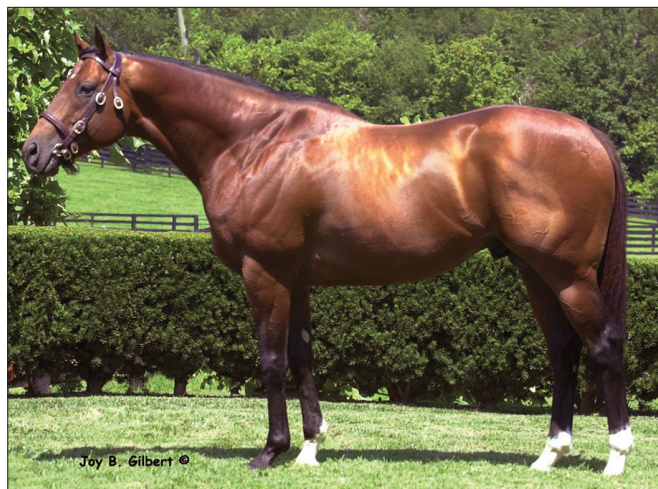
LeMesa Stallions' Yankee Gentleman leads all sires in the region with earnings of $2,776,561 in 2011, including a Louisiana-best six stakes winners