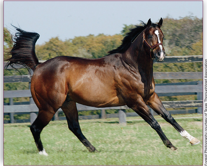
Valid Expectations, who stands at Lane's End Texas, maintains his position atop the Texas sire list in 2011 with earnings of more than $1.44-million

Favorite Trick may be gone but he is certainly not forgotten in his adopted home of New Mexico. The 1997 Horse of the Year perished in a barn fire in 2006, but half a decade later remains a top-ten sire in New Mexico. Favorite Trick's final Thoroughbred crop included 2011 stakes